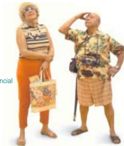
Sculpture by Duane Hanson, Tourists , 1970